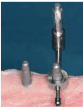
The external fixation device is attached to a one-piece dental implant abutment via the affixing ring and screwed on tightly.