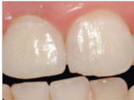
One year follow-up appearance.

The present study shows promising results for immediate loading of single implants. All implant sited fulfilled success in terms of function and esthetics, and particularly promising results were seen following additional adjustments of the provisional restorations to preserve interdental papilla.